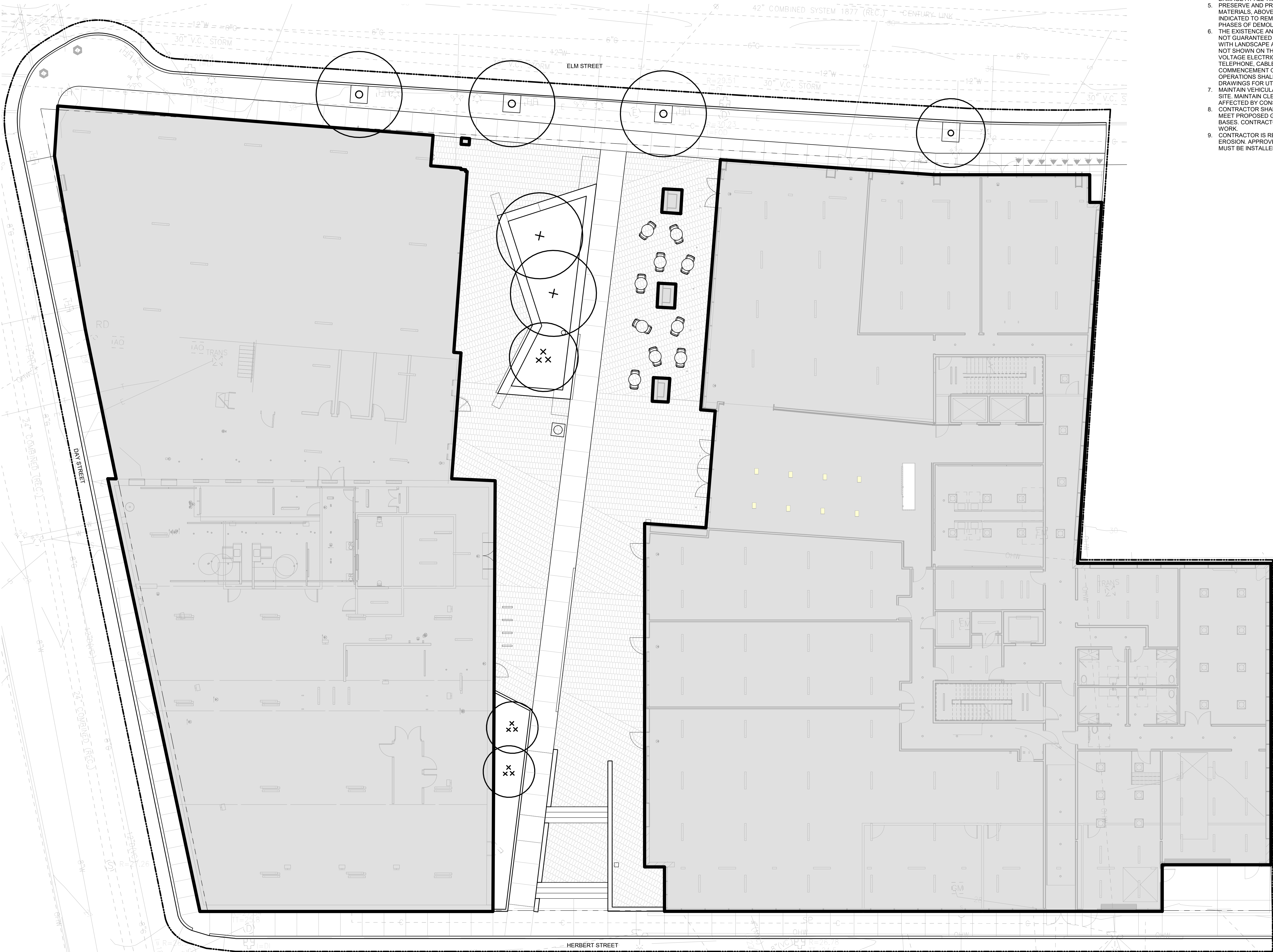
1 SITE PLAN 1" = 10'-0"